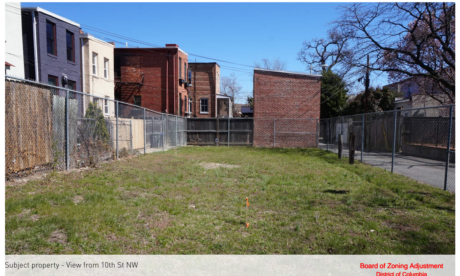
Subject property - View from 10th St NW

Board of Zoning Adjustment District of Columbia CASE NO 19768