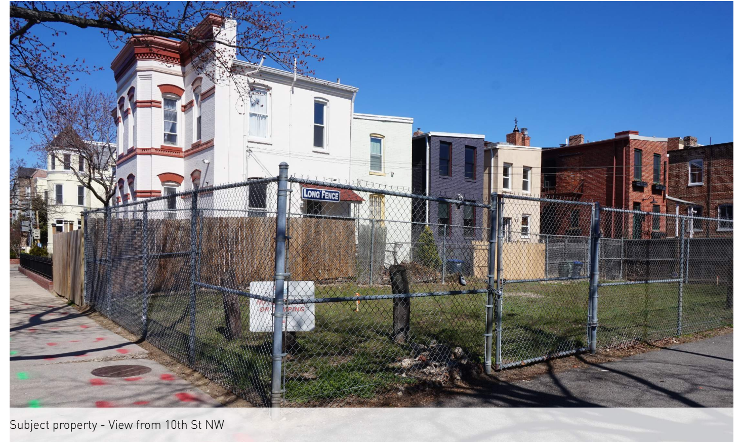
Subject property - View from 10th St NW