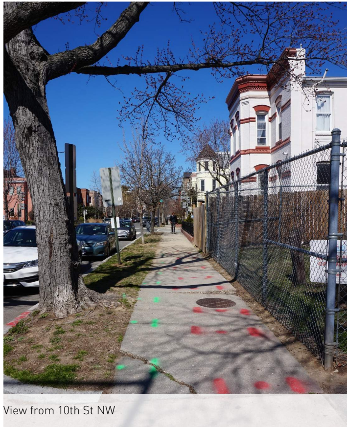
View from 10th St NW