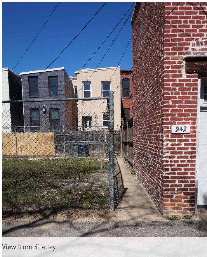
View from 4' alley