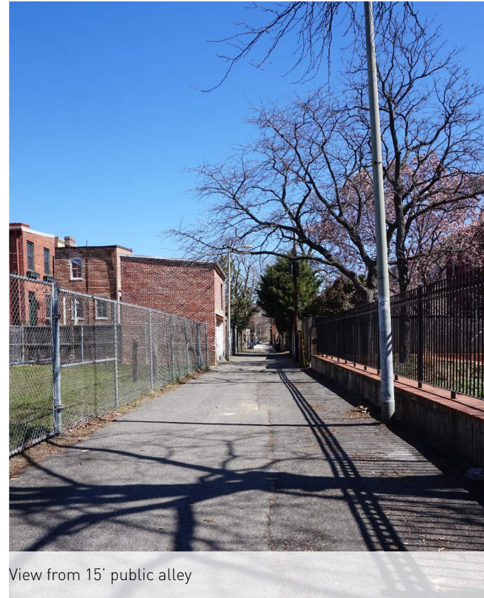
View from 15' public alley